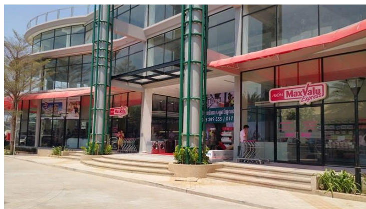
【AEON Maxvalu Express Reoussey Keo Store】

Through further developing its SM business, Aeon Cambodia will strive to make life more convenient and prosperous for its customers in Cambodia by leveraging resources from its GMS business.