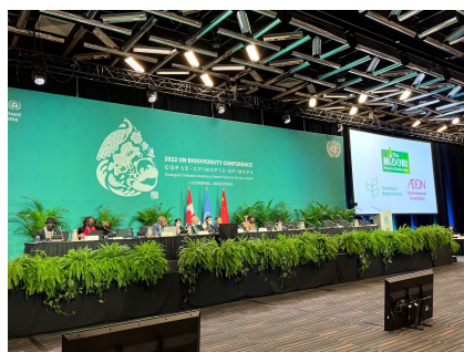
Winners introduction at COP15 of the Convention on Biological Diversity

Video: https://www.aeon.info/ef/en/prize/midori/winner/