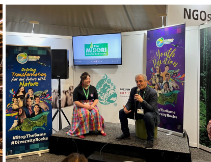
Winners talk at the youth event