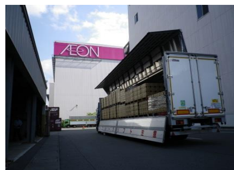
Unloading the truck for delivery