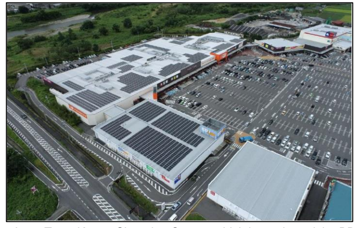
The Aeon Town Konan Shopping Center, which has adopted the PPA model.

Aeon's first 100% renewable energy store, the Aeon Fujiidera Shopping Center opened in 2019.