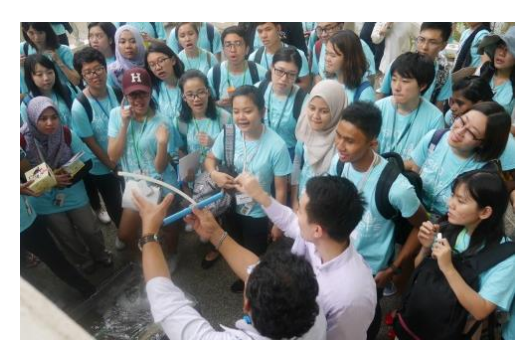
7th Event, 2015 (Thailand) Theme: Water Quality Problems 45 university students and 66 high school students from China, Indonesia, Japan, Malaysia, Thailand and Vietnam participated