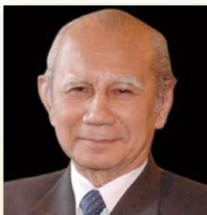
Chairman of the Advisory Council to the President of Indonesia Former Minister of State for Population and the Environment