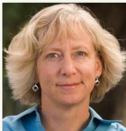
Professor, Stanford University