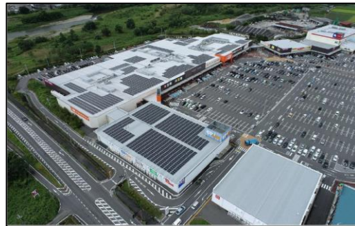
(Right) Aeon Town Shonan Shopping Center The PPA model has been adopted