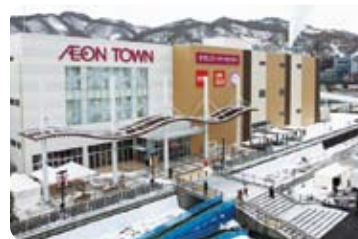
Aeon Town Kamaishi Opened in March 2014

In March 2013, Aeon concluded the "Agreement Regarding Installment of a Large-Scale Commercial Facility and Contribution to the Local Community" with Kamaishi city in Iwate prefecture which is working hard toward reconstruction. Together with the city, Aeon opened Aeon Town Kamaishi in March 2014 to create a city that takes disaster prevention and evacuation systems into consideration. Towards the realization of safe and prosperous living, Aeon opened 15 stores in the six prefectures of the Tohoku region during FY2014. We are also working together with government and regional organizations to conduct special projects for relaying cuisine and culture that is local to Tohoku.