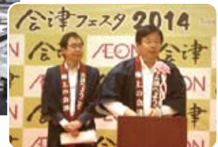
Aizu Festival held with Aizuwakamatsu city