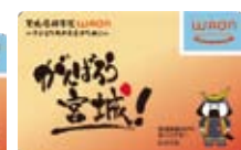
Recipients: Great East Japan Earthquake Miyagi Children's Fund