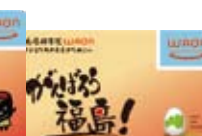
Recipients: Fukushima Donation for Orphans affected by Great East Japan Earthquake