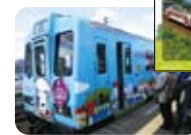
Minami Riasu Line WAON train