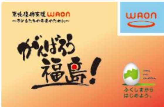
Ganbaro (Stay Strong), Fukushima! WAON for Tohoku Restoration