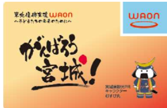
Ganbaro (Stay Strong), Miyagi! WAON for Tohoku Restoration