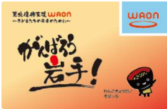
Ganbaro (Stay Strong), Iwate! WAON for Tohoku Restoration