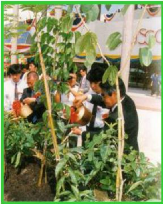
1991 The first "Aeon Hometown Forests" in JUSCO Malacca Store, Malaysia (present Aeon Malacca Shopping Center)