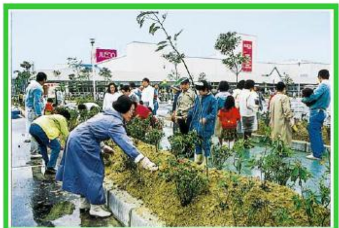
The first "Aeon Hometown Forests" in Japan JUSCO Shin Hisai Store (present Aeon Hisai Store)

"Great Wall Tree Planting project in Beijing" sponsored by the Aeon Environmental Foundation. A total of 1 million trees have been planted over the project period of 12 years.