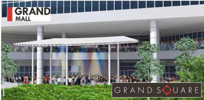
Illustration of "GRAND SQUARE"