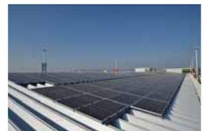
(Illustration of "solar power generation system")

* Power usage of general households: 12 kWh per day (3kW x 0.4 x 10h)