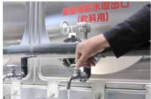
(Illustration of a “temporary water supply tackle for the water receiving tanks”)