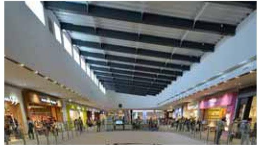
(Illustration of “skeleton ceiling”)