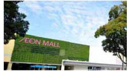
(Illustration of "wall greening")

By adopting wall greening for some parts of exterior wall of car parks, we will aim to realize earth consciousness and harmony with surrounding environment (design).