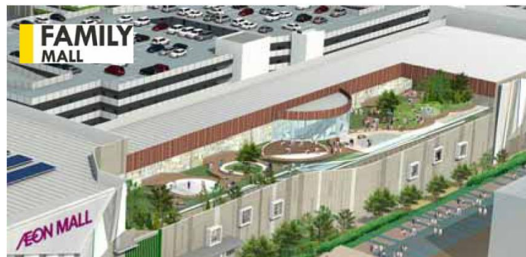
Illustration of "SKY PARK"