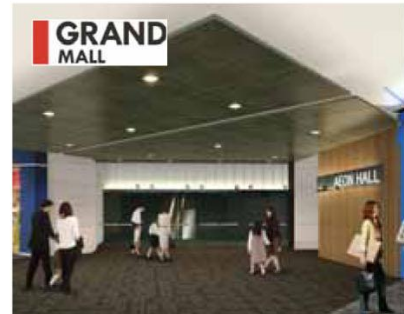
Illustration of "AEON HALL"