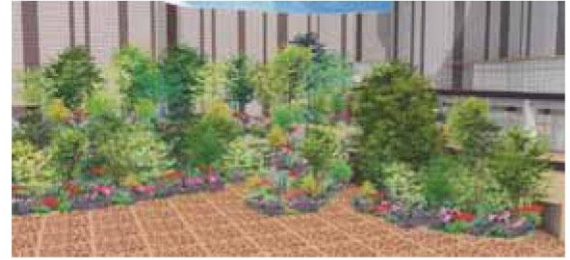
(Illustration of the “garden”)

“Garden terrace” in the Makuhari Shintoshin area is composed of the Mall’s promenade (“GREEN WALK”), cafeteria zone and outdoor event space (“GRAND SQUARE”) combined with surrounding walkways and “Toyosuna Park.” In addition, we are planning to build a multistory garden around the central entrance of “GRAND MALL” under the supervision by internationally-acclaimed gardener Kazuyuki Ishihara *1 . The garden featuring greens and water streams will be a place where people can relax, providing dynamic yet nostalgic atmosphere. By choosing trees with flowers throughout the year with a focus on cherry ( Cerasus serrulata 'Tairyozakura'), crape myrtle, camellia, sasanqua, etc., plants which have resistance to salt damage, the garden will play a central role and functions with appropriate setup as a symbol of “garden terrace” in the Makuhari Shintoshin area.