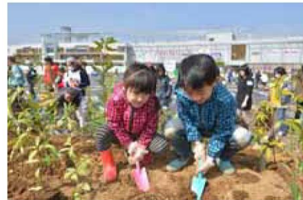
(Illustration of "tree-planting ceremony")

As part of its environmental conservation and social activities to work together with customers in local communities, Aeon has been holding "Aeon Hometown Forest Program". During the programs, local residents and Aeon employee plant saplings of trees that are naturally grown in each region within the site of Aeon facilities. After the programs, the saplings are carefully nurtured for a long period of time. At the Mall, approximately 5,000 local residents are expected to join us to plant some 50,000 trees on November 17 (Sun). After this activity, the accumulated total number of trees to be planted through the Aeon Environmental Foundation and "Aeon Hometown Forest Program" tree-planting activity will reach 10 million.