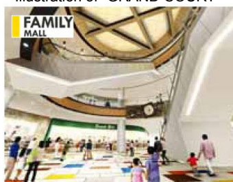
Illustration of "FAMILY COURT"