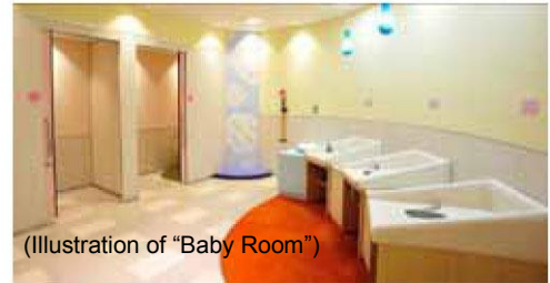
(Illustration of "Baby Room")