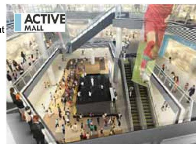
Illustration of "SPORTS AUTHORITY COURT"