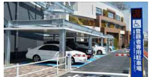
(Illustration of "Designated car spaces for customers with physical disabilities or other difficulties")

A total 124 parking spaces designated for customers with physical disabilities or other difficulties have been placed closer to the entrances of each building. In addition, 43 of these spaces will be equipped with "automatic gates" that respond to pre-registered cars in order to prevent customers without physical disabilities from parking in the designated areas.