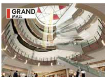
Illustration of "GRAND COURT"