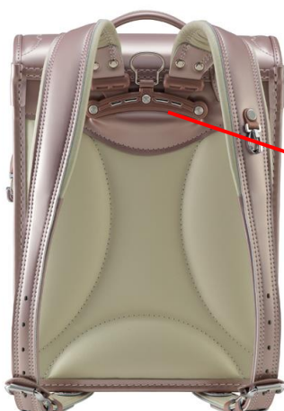
[Attached part where rivets are used (buckle)]