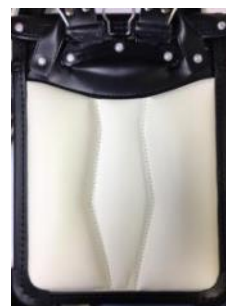
(Conventional back panel)

To reduce the physical burden for children due to the heavier weight of the large-capacity Randoseru, a comfortable back panel has been developed under the guidance of Professor Nagamachi, a pioneer of sense-of-quality engineering. By supporting the body with pads in three locations including the middle of the back, under the scapula on both sides and around the waist, the burden on the shoulders is reduced by distributing the weight of the Randoseru, creating a light feel and comfortable fit. In addition, the unevenness of the pads helps to enhance the breathability when the back panel is pressing on the body, reducing sweatiness on the back.