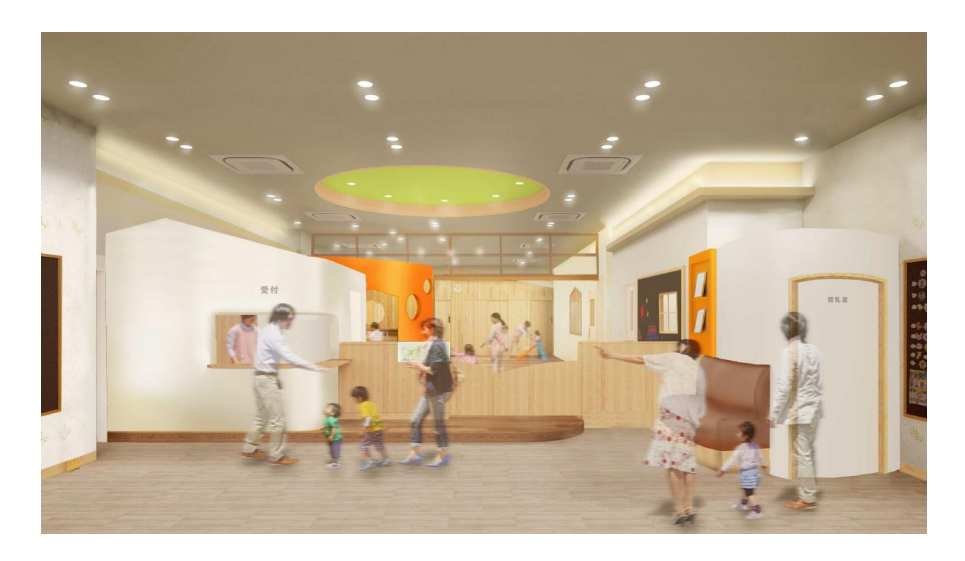
Monthly childcare facility entrance

Facility area: 479.10 m<sup>2</sup> (144.93 tsubo ) Established by: AEON TOWN Co., Ltd. Operated by: teno Corporation