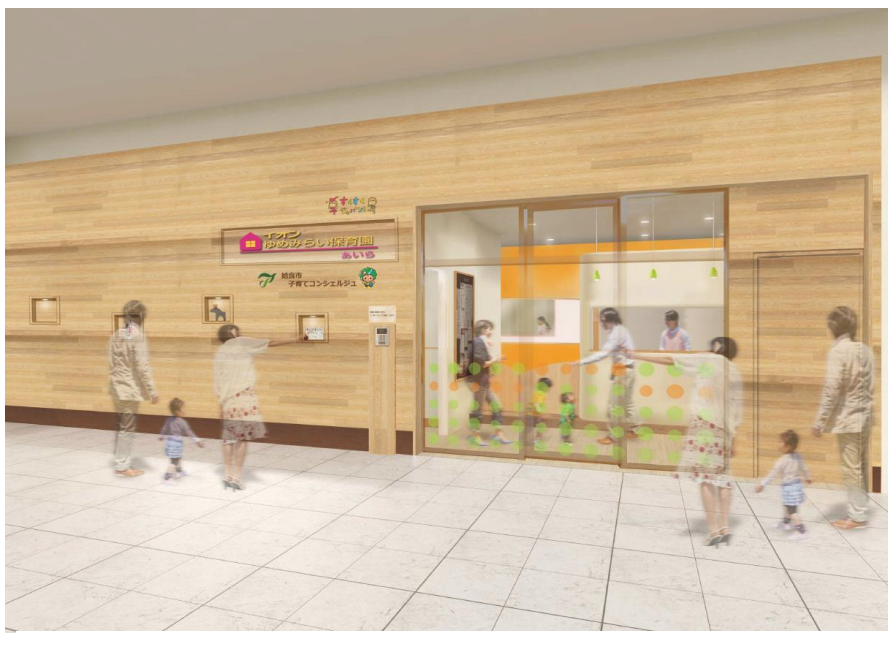
Entrance to Aira-shi Childcare Concierge Service and temporary childcare service